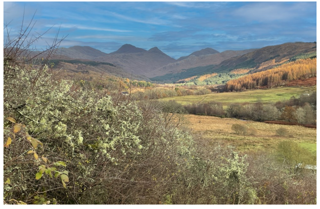
Charming, detached cottage with garden grounds set in approx. 1.35ha to include surrounding croftland

Full planning permission to extend the cottage obtained in Sept 2022