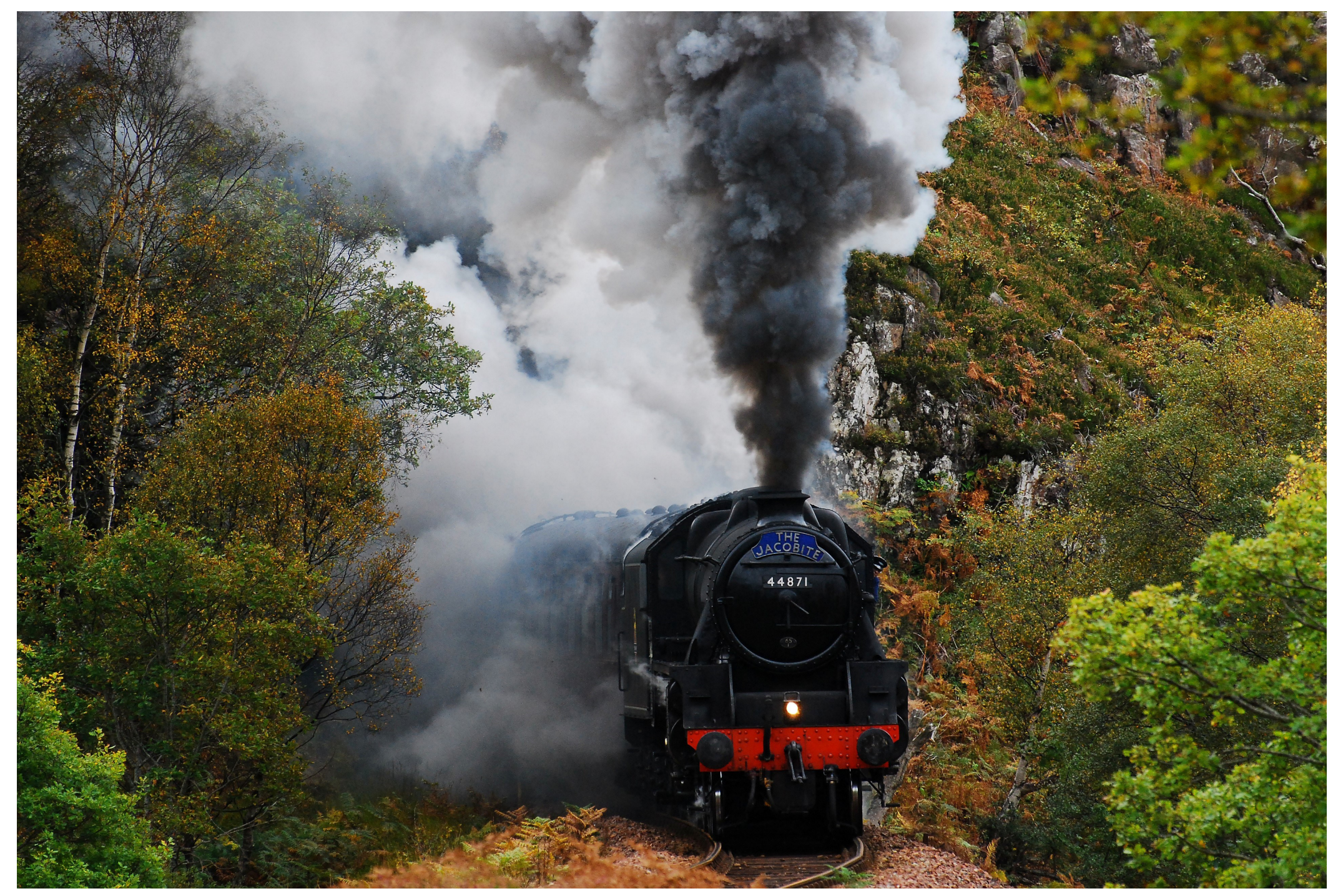
The Jacobite Steam Train (AKA Hogwarts Express) arriving at Beasdale platform, visible from the cottage