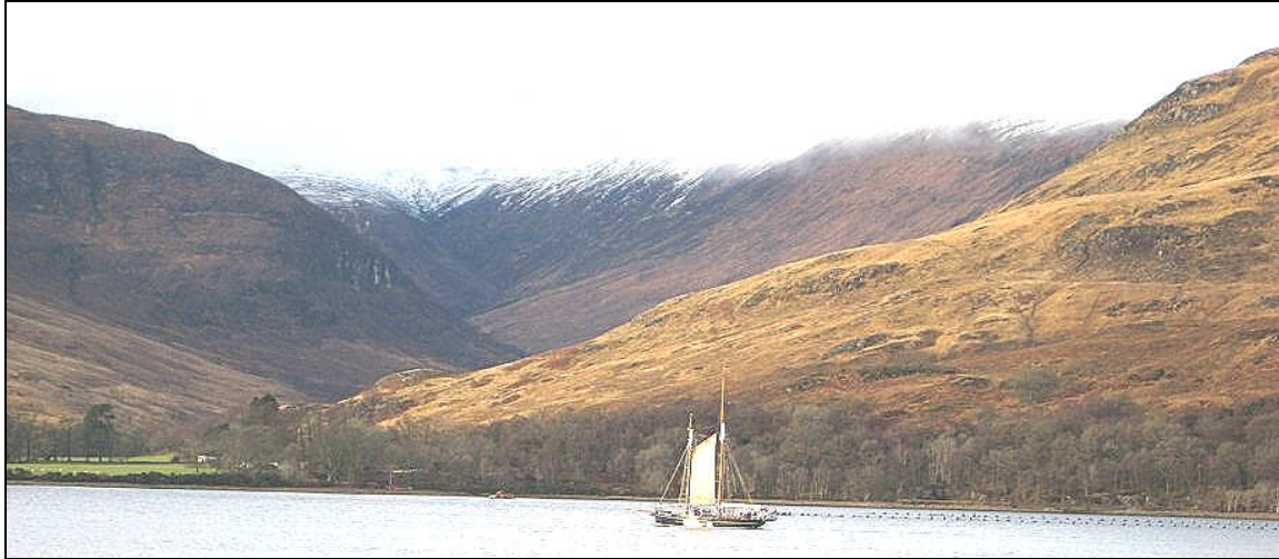
View from front of house