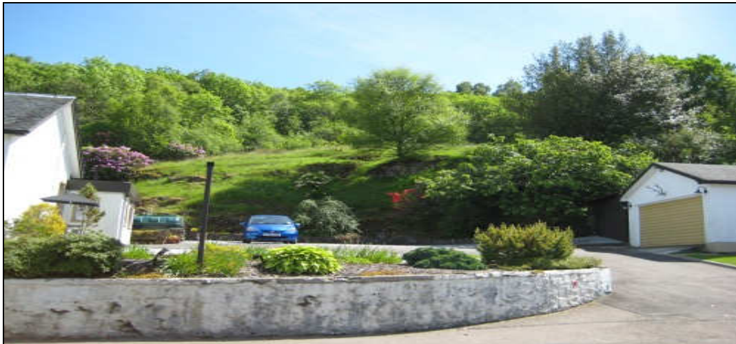
Substantial carparking area to side of house

Offers should be submitted to the Selling Agents in Scottish legal terms. The Seller will not be bound to accept the highest, or indeed any, offer. Interested parties should register their interest with the Selling Agents lest a closing date for offers is set, but the Seller will not be obliged to proceed to a closing date.