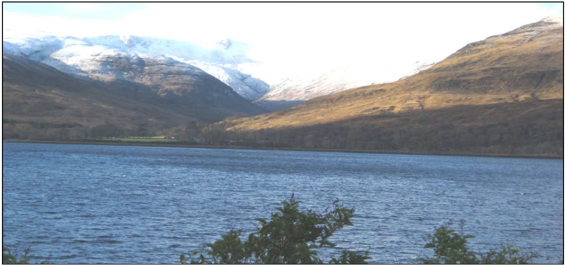
View from front of house